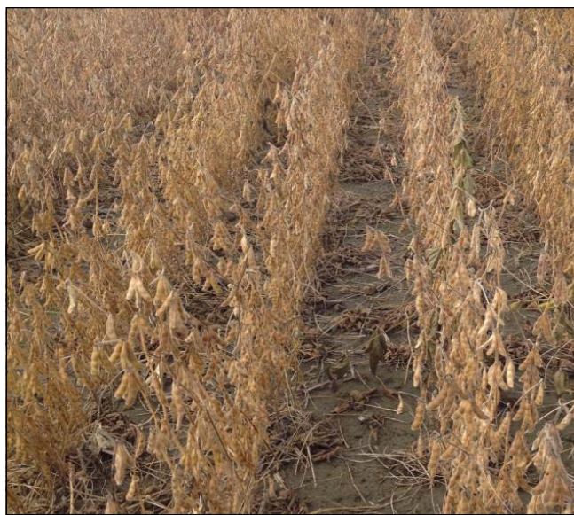
St Pascal, ON

Monsanto Company is a member of Excellence Through Stewardship® (ETS). Monsanto products are commercialized in accordance with ETS Product Launch Stewardship Guidance, and in compliance with Monsanto's Policy for Commercialization of Biotechnology-Derived Plant Products in Commodity Crops. These products have been approved for import into key export markets with functioning regulatory systems. Any crop or material produced from these products can only be exported to, or used, processed or sold in countries where all necessary regulatory approvals have been granted. It is a violation of national and international law to move material containing biotech traits across boundaries into nations where import is not permitted. Growers should talk to their grain handler or product purchaser to confirm their buying position for these products. Excellence Through Stewardship® is a registered trademark of Excellence Through Stewardship.